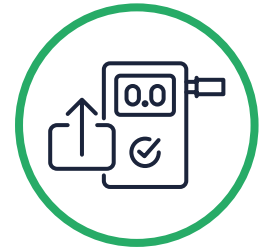
Photo records can be used to confirm identity in relation to tests and can be included in reports for monitoring a user's compliance.

Smart Mobile uses facial detection and photo ID. A digital image of the user is captured and stored at every test.